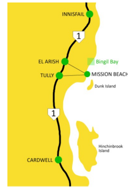
MISSION BEACH TO TOWNVILLE 230KM