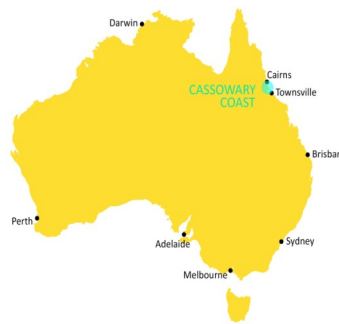
MISSION BEACH TO CAIRNS 140KM