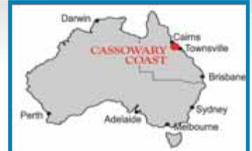
Mission Beach to Cairns 140km

We look forward to seeing you at Sanctuary.