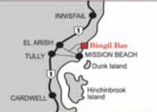
Mission Beach to Townsville 230km